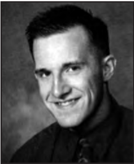
and then - senior photo

One of the big questions that high school principals have been asking ourselves is what students truly need to be successful in the economy of the 21st century. The reality is that there are not many jobs where you can get hired without any experience and work your way up to a living wage. However, there are many living wage jobs that only require a certificate program that can be entered with only a high school degree. We also know that there are many, many jobs that require workers to be able to work collaboratively to problem solve in collaborative groups. The challenge for us is considering whether the traditional models of teaching are the best methods for preparing our students for this world. That work will continue this year, as we pursue answers to hard questions. The start of another school year always brings such a rush of emotions. The end of the experiences and joys of Summer balanced with the thrill of being able to welcome another class of Ballard High School to our hallowed halls. What heights will this year bring for our students? What knowledge will be bestowed by our faculty? The possibilities are truly endless and the importance of education has never been evident. Thank you for keeping the dreams of our students alive. It's Always Great to be a Beaver!