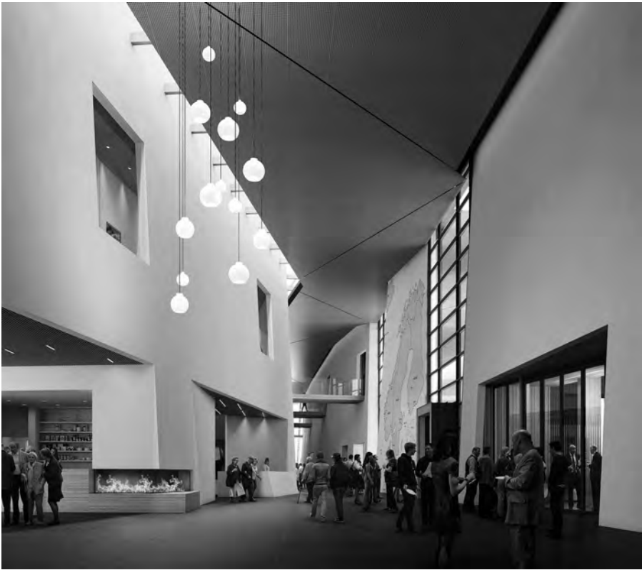
Nordic Heritage Museum - Snow Fjords Design by Mithun

fjord intensify the experience of migration, connecting Nordic and Nordic American exhibits. A vertically striated zinc skin will wrap the building exterior; inside, fjord walls will be composed of faceted white planes evoking its glacial origins. Along with the core exhibition galleries, active social areas — cafe, store, auditorium, and classrooms — will expand the Museum’s capabilities and audiences.