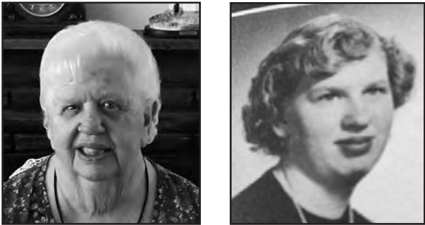
now and then - senior photo